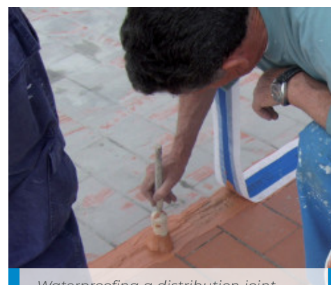
Waterproofing a distribution joint with Mapeband fixed in place with Aquaflex Roof