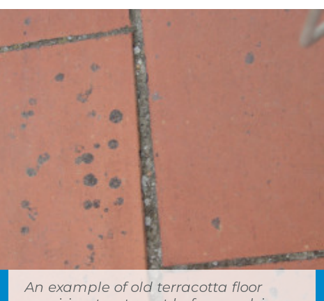
requiring treatment before applying Aquaflex Roof