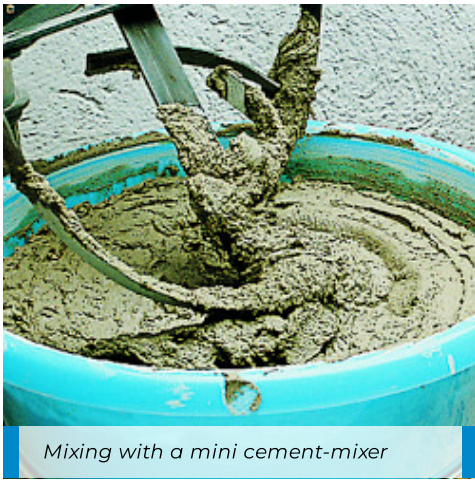
Mixing with a mini cement-mixer