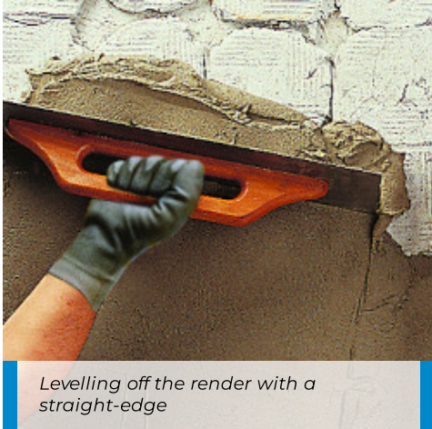
Levelling off the render with a straight-edge