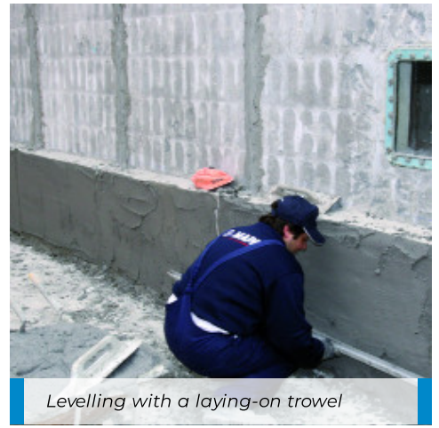
Levelling with a laying-on trowel