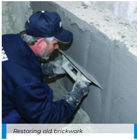
Restoring old brickwork