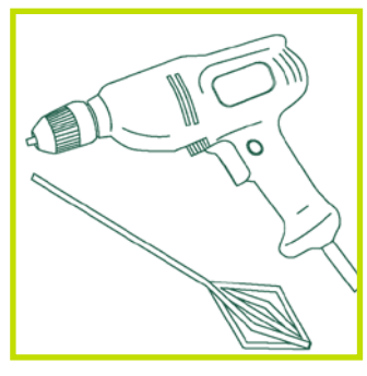
Rose bud paddle in electric drill 900rpm 1000w.

There is no need to prime any reinforcement, but if priming is preferred, any conventional system may be used.