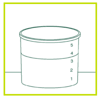
Place 3 litres of water into a container.