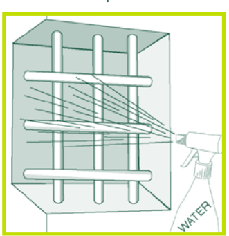
Well dampen the concrete with water ensuring no standing water.