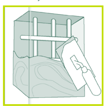
Mix LUL RAPIDESET as instructed and place the mortar, ensuring at all times a minimum thickness of 2mm.