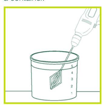
After the LUL RAPIDESET has been added mix for at least 2 minutes.