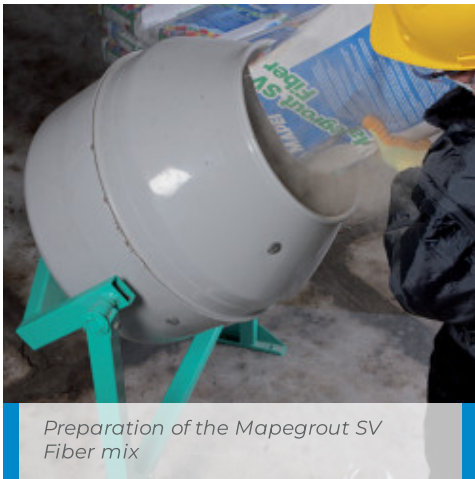
Preparation of the Mapegrout SV Fiber mix