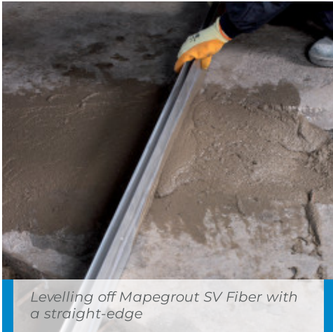
Levelling off Mapegrout SV Fiber with a straight-edge