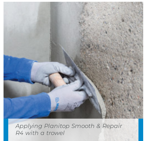
Floating the surface of Planitop Smooth & Repair R4