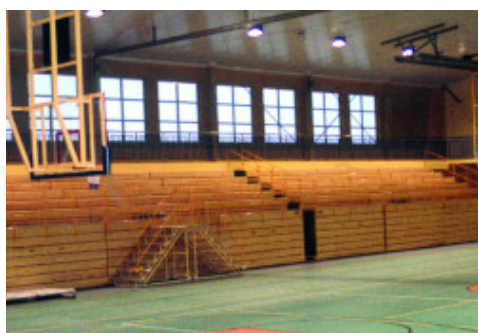
Example of Primer G applied before laying PVC and linoleum in a public gymnasium - Gdansk Orunia Indoor Gymnasium - Poland