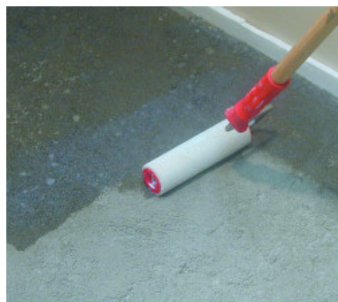
Applying Primer G with a roller