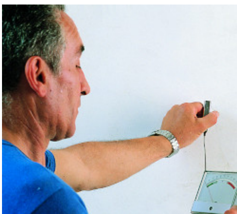
Checking gypsum plaster humidity