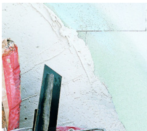
Use as a primer for gypsum plasters