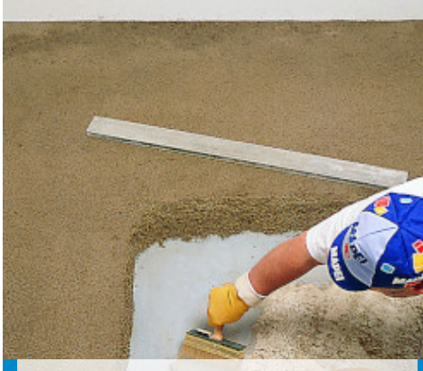
Spreading the anchoring slurry for bonded Topcem screeds