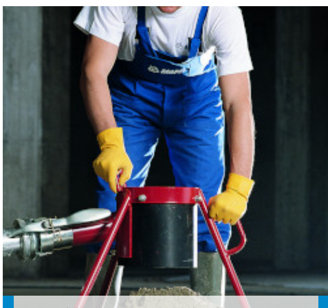
Batching a Topcem mix