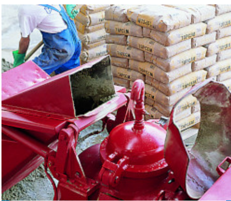
Mixing Topcem with an automatic pumping unit